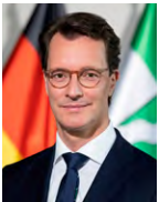
Hendrik Wüst Minister President of the State of North Rhine-Westphalia

North Rhine-Westphalia and the United States have been linked by a deep friendship and partnership for decades. We are expanding this further with the NRW-USA Year 2023/2024. Within the scope of this transatlantic friendship, lawyers from our state will also study in the USA and gain further qualifications there. The „DAJV LL.M. Day“ organized by the German-American Lawyers Association have been preparing them for this for many years. I would like to sincerely thank everyone involved in this scheme. This year, the „DAJV LL.M. Days“ will once again take place in Cologne, the largest city in North Rhine-Westphalia! You can look forward to many exciting encounters, a valuable exchange of ideas and lots of information about the possibilities of studying for a „Master of Laws“ in the United States.